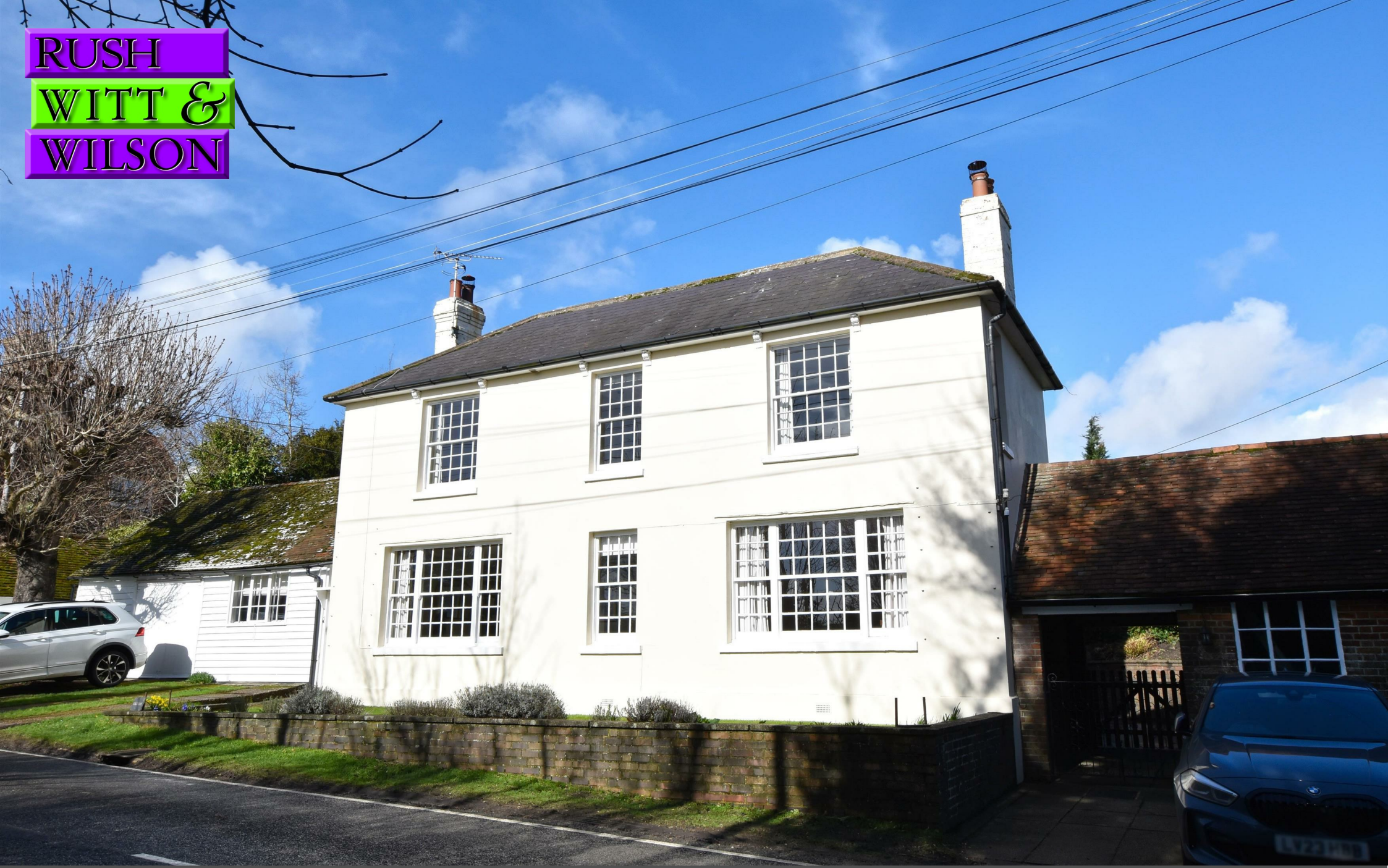
Forge House, Udimore Road, Udimore,, East Sussex TN31 6AY Guide Price £850,000